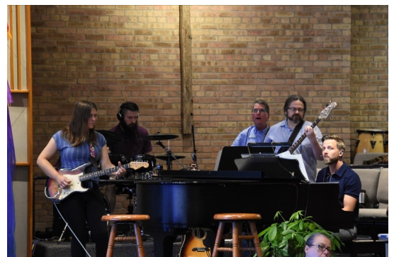
June 23, 2024 :Top- St. Louis Youth Group; Bottom- Peace Band members